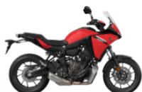
Yamaha Tracer 7