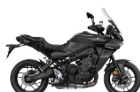
Yamaha Tracer 9